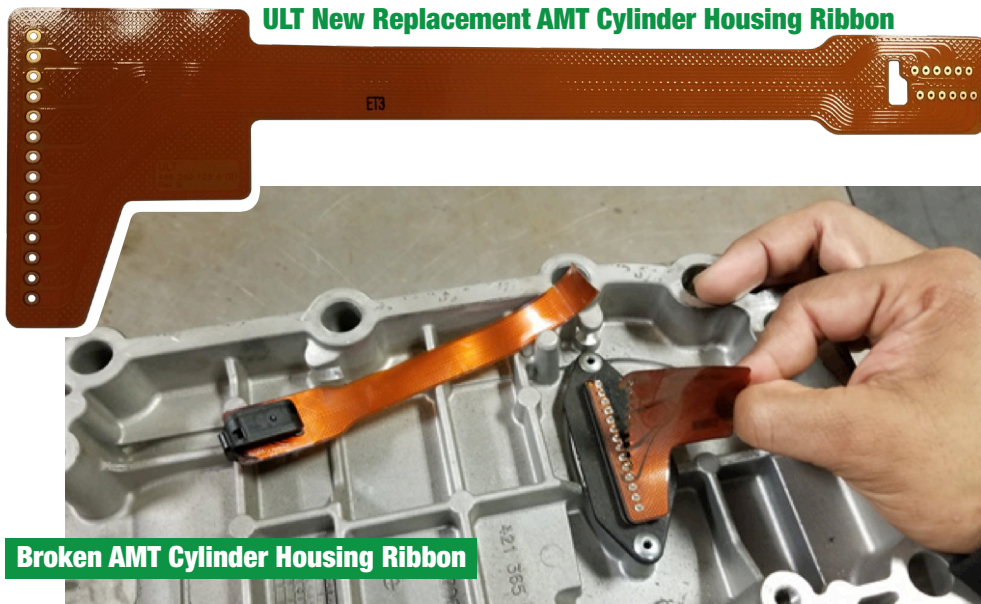
Broken AMT Cylinder Housing Ribbon