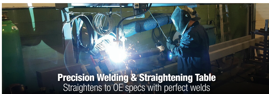
Precision Welding & Straightening Table Straightens to OE specs with perfect welds