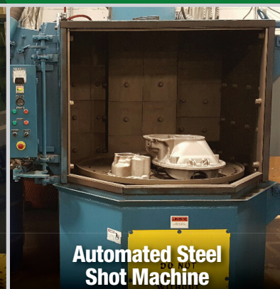
Automated Steel Shot Machine

Don't have what you need? Call us at 905.612.1256. Regardless of your Driveline Needs, ULT is Your Solution!