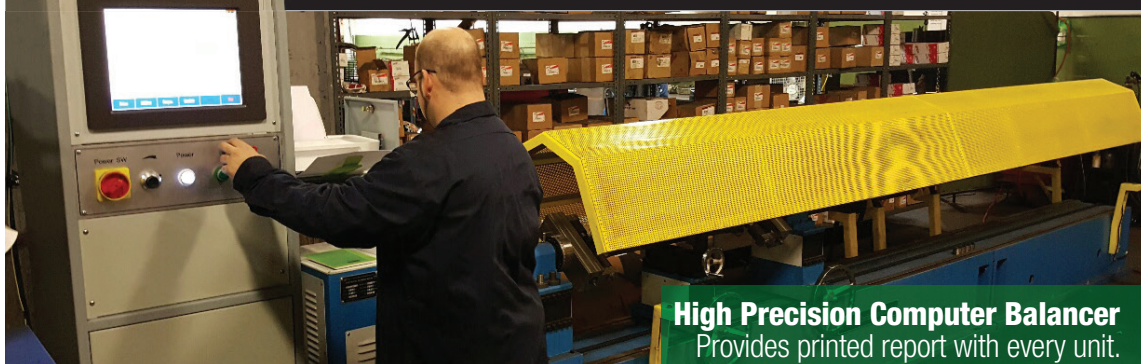
High Precision Computer Balancer Provides printed report with every unit.

Test Duration = 5 min. 3 sec. Post-Balance Results Head: 0.001" @ 287° Tail: 0.001" @ 224° Phone: (613) 521-3555