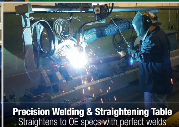
Precision Welding & Straightening Table Straightens to OE specs with perfect welds